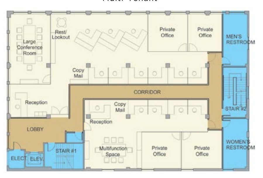
Office Layout: SingleTenant